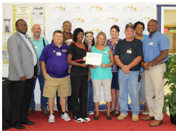
CSS "Little Red Riding Hood" Production Gold Team Award